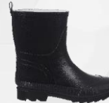
RUKKA RAUTIO MR 7 78 475 120 R