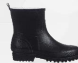
RUKKA RAUTIO MS 7 75 475 120 R